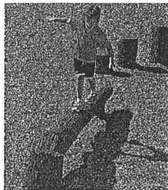
8FT Fallen Tree Balance Beam