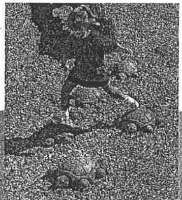
5ST Stepping Turtles