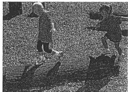
6HL Half Log Beam