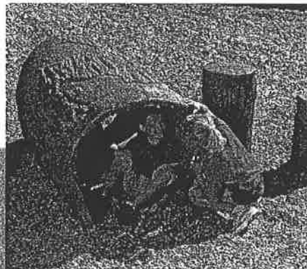
4LT Log Tunnel