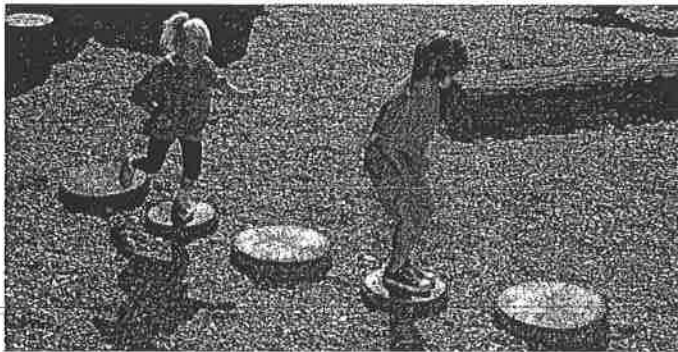
5TSL Tree Slices