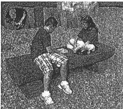
4LB Log Bench